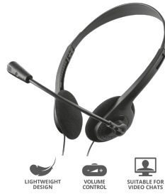
PRODUCT ESHOT 1