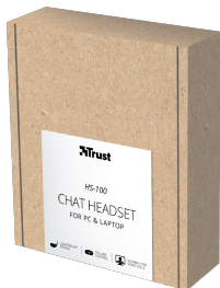
PACKAGE VISUAL 1