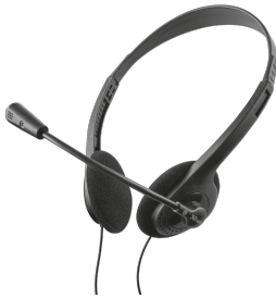
PRODUCT VISUAL 1