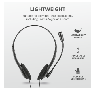
PRODUCT PICTORIAL 2