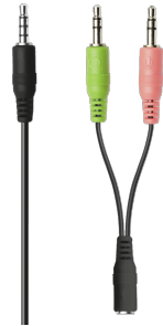
PRODUCT EXTRA 2