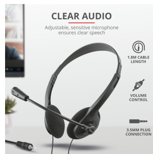
PRODUCT PICTORIAL 1