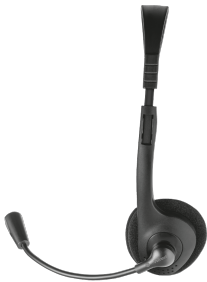
PRODUCT SIDE 1