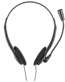
PRODUCT TOP 1