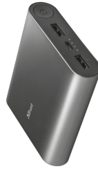
PRODUCT VISUAL 2