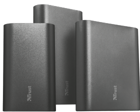
PRODUCT FAMILY 1