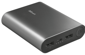
PRODUCT VISUAL 1