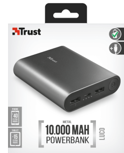
PACKAGE FRONT 1