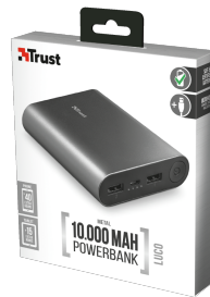
PACKAGE VISUAL 1