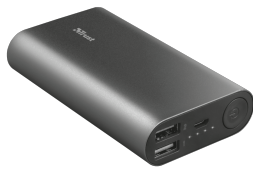
PRODUCT VISUAL 1