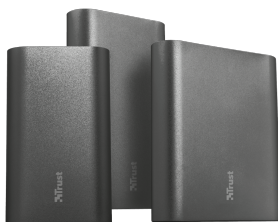
PRODUCT FAMILY 1