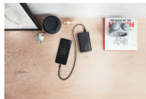
LIFESTYLE VISUAL 2