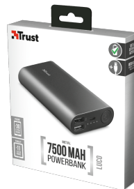
PACKAGE VISUAL 1