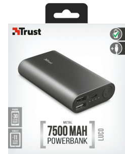
PACKAGE FRONT 1