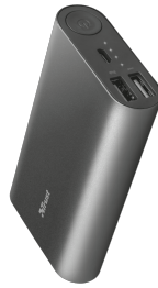
PRODUCT VISUAL 2