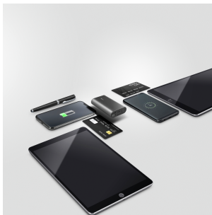
LIFESTYLE VISUAL 1