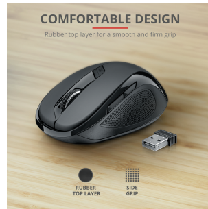
PRODUCT PICTORIAL 1