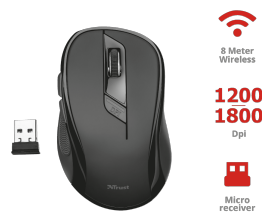
PRODUCT ESHOT 1