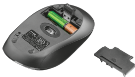
PRODUCT BOTTOM 1