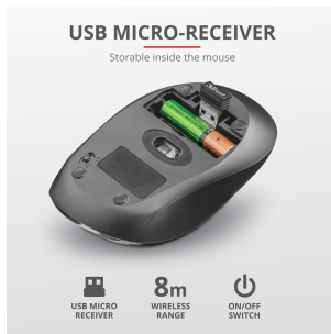
PRODUCT PICTORIAL 3