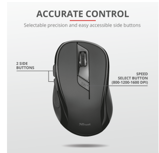
PRODUCT PICTORIAL 2