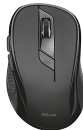
PRODUCT TOP 1