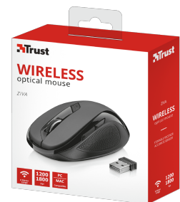
PACKAGE VISUAL 1